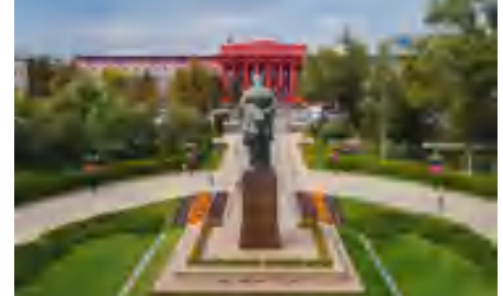
Park named after T. Shevchenko