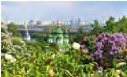
National Botanical Garden named after M. M. Hryshko